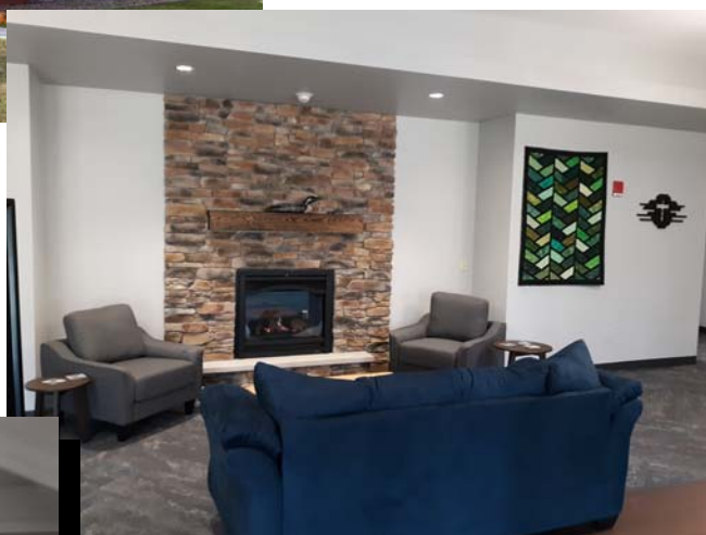
Lobby and Fireplace

Large meeting space for 280, small meeting for 20, beautiful lobby with coffee bar and room to relax and large beautiful bathrooms all handicap accessible