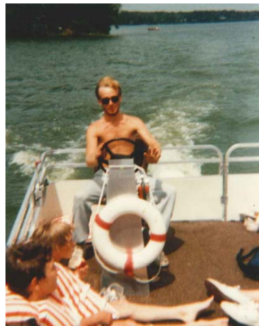
What pastor is this? Circa 1990

info@lutherpark.org or call 715-859-2215.