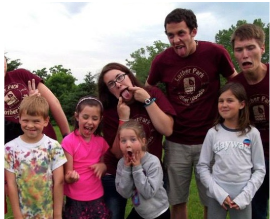
Which one is in Seminary? 2013